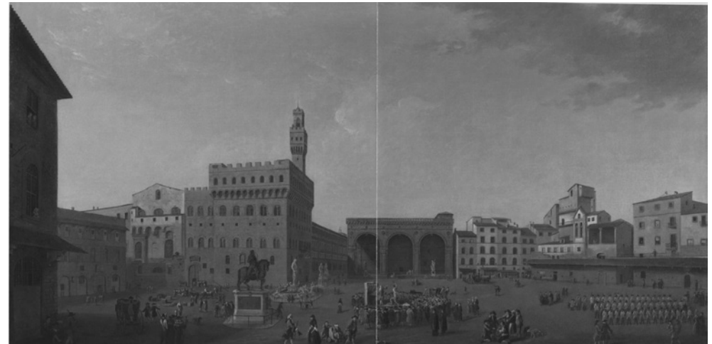
Thomas Patch, Florence, View of Piazza della Signoria, oil on canvas, Private Collection